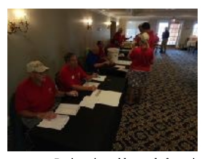
Registration tables ready for action.